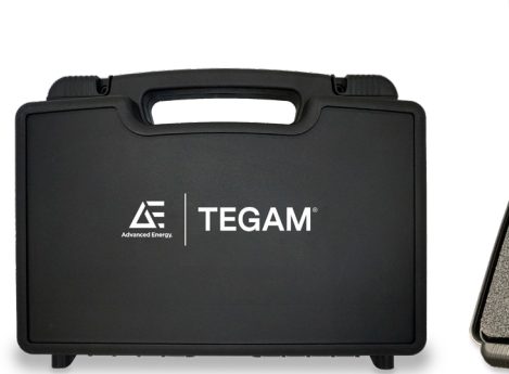
700-911 Foam-Filled Hard Carry Case