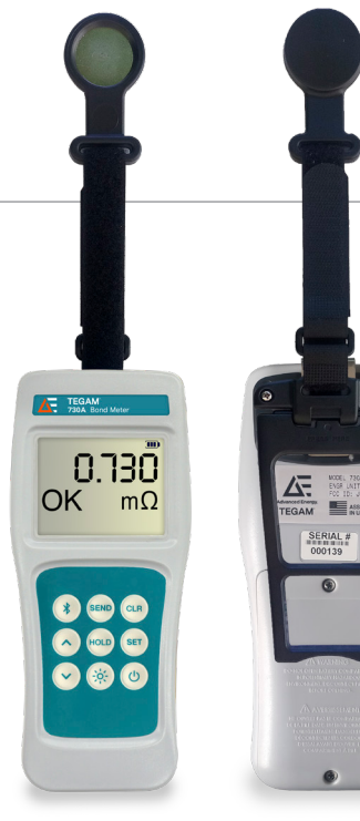
700-910 or 700-912 Tilt Stand / Magnetic / Hanger