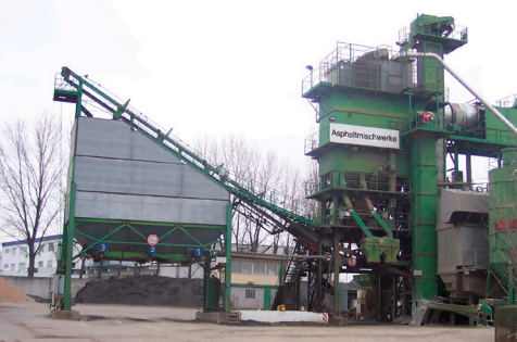
Temperature-controlled asphalt mixing plant

a major contributor to optimum process control. First, pyrometers are well suited to measure the temperature of the mixture moving inside the drum dryer to help maintain a uniform temperature of the asphalt mixture. A second pyrometer can be introduced at the discharge chute to measure the temperature of the finished product as it is conveyed to the storage silos.