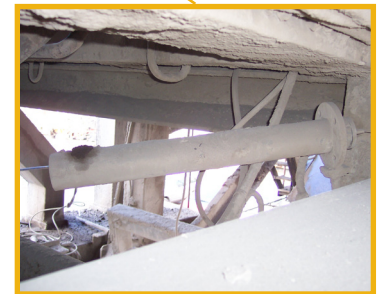
Temperature measurement at mixture discharge chute