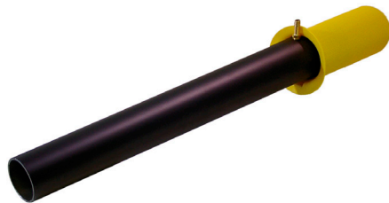
Mounting tube for IN 5 and IN 300 designed for asphalt mixing plants